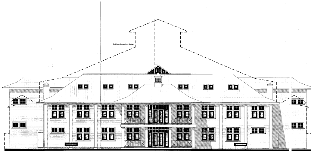
Front Elevation - Facing Green Lane